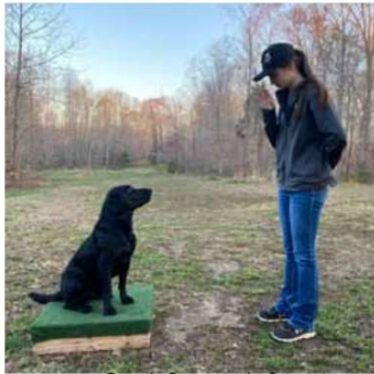
Deep in Concentration?

All of these pets were rescued and are living happily ever after in their forever homes.