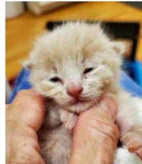
Apollo, near 2 weeks old

Last spring a kind citizen reported finding a newborn kitten to Garfield's Rescue Inc. (GRI). The kitten, named Apollo, required bottle feeding every 3 hours. Later Apollo's mother and siblings were located and reunited with Apollo in foster care and all was well. The best news is that Apollo's family were all adopted. If you find a kitten(s), please do not pick them up. First, observe the kitten(s) from a distance. Yes, they are precious, but this is a critical time for a kitten. According to Alley Cat Allies, "Separating kittens younger than ~8 weeks old from their mother is harmful to their wellbeing. Kittens need their mother and she is their best possible caregiver." The kittens may seem abandoned, however, the mother cat may not be far away. She could be hunting, hiding, or waiting for you to move away from her babies. If the kittens are sleeping and seem content, then the mother is probably nearby. Check on the kittens every few hours. When you check the area again and there are fewer kittens, the mother is most likely